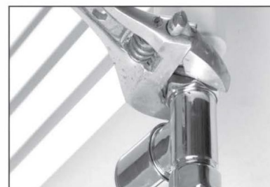
5. Fully tighten the valve using an appropriate tool