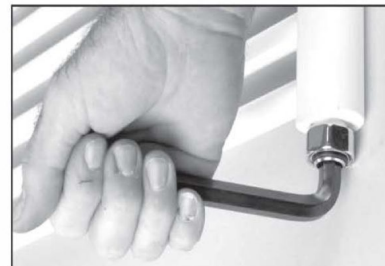
3. Tighten using an appropriate tool