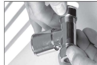
4. Attach valve and turn finger tight in to the correct position