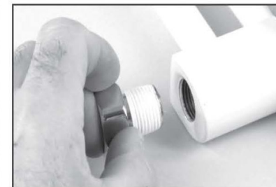
2. Screw the threaded end into the radiator or towel rail