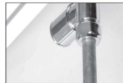
6. Insert pipe .