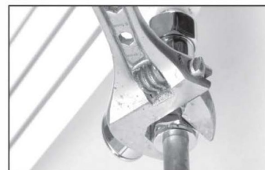
7. Tighten the the nut that holds the pipe in position