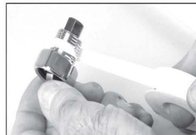
1. Wrap PTFE tape clockwise around the tail thread