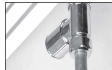
8. Run the central heating to the radiator