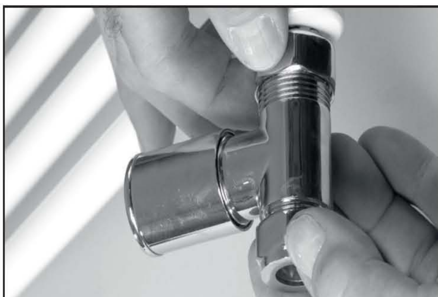
4. Attach valve and turn finger tight in to the correct position