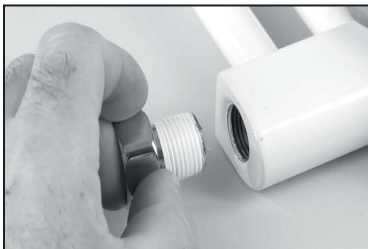
2. Screw the threaded end into the radiator or towel rail