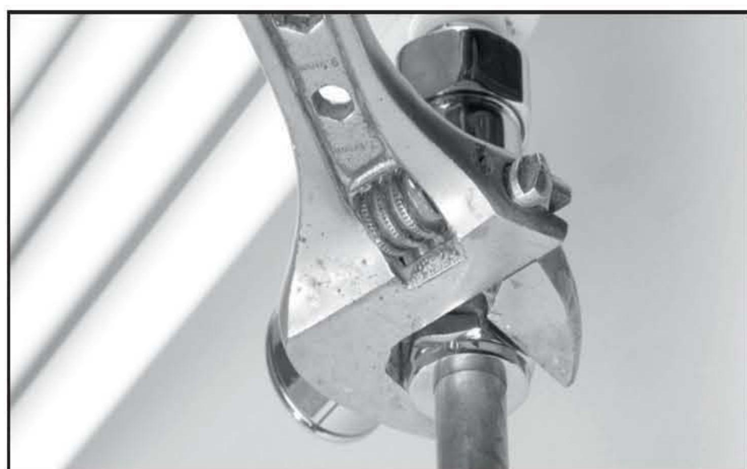
7. Tighten the the nut that holds the pipe in position