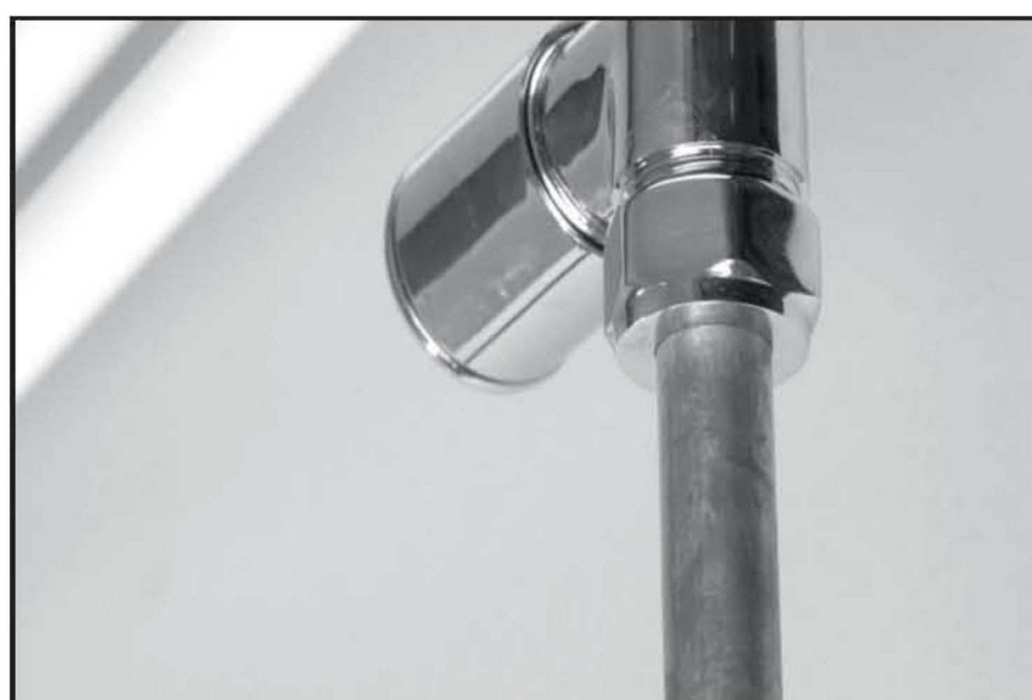
6. Insert pipe.