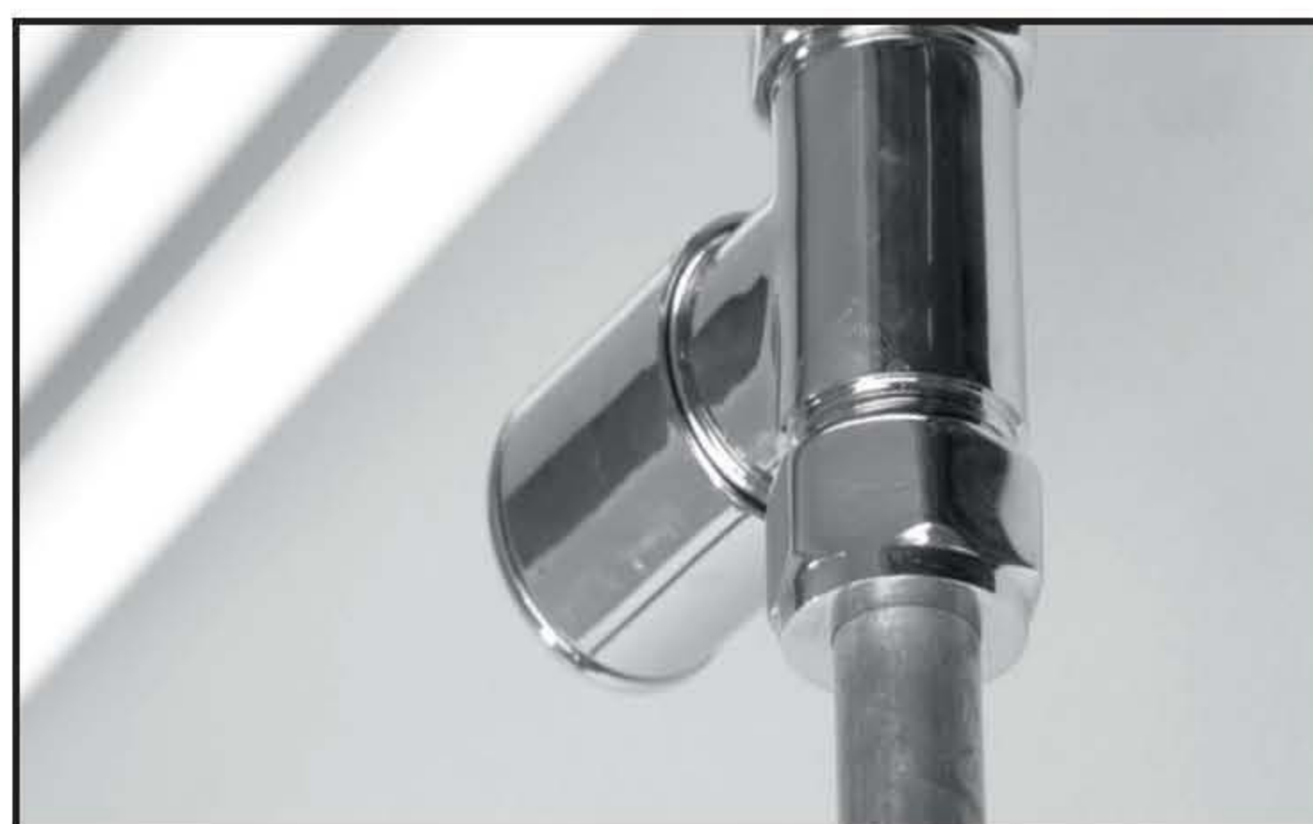
8. Run the central heating to the radiator