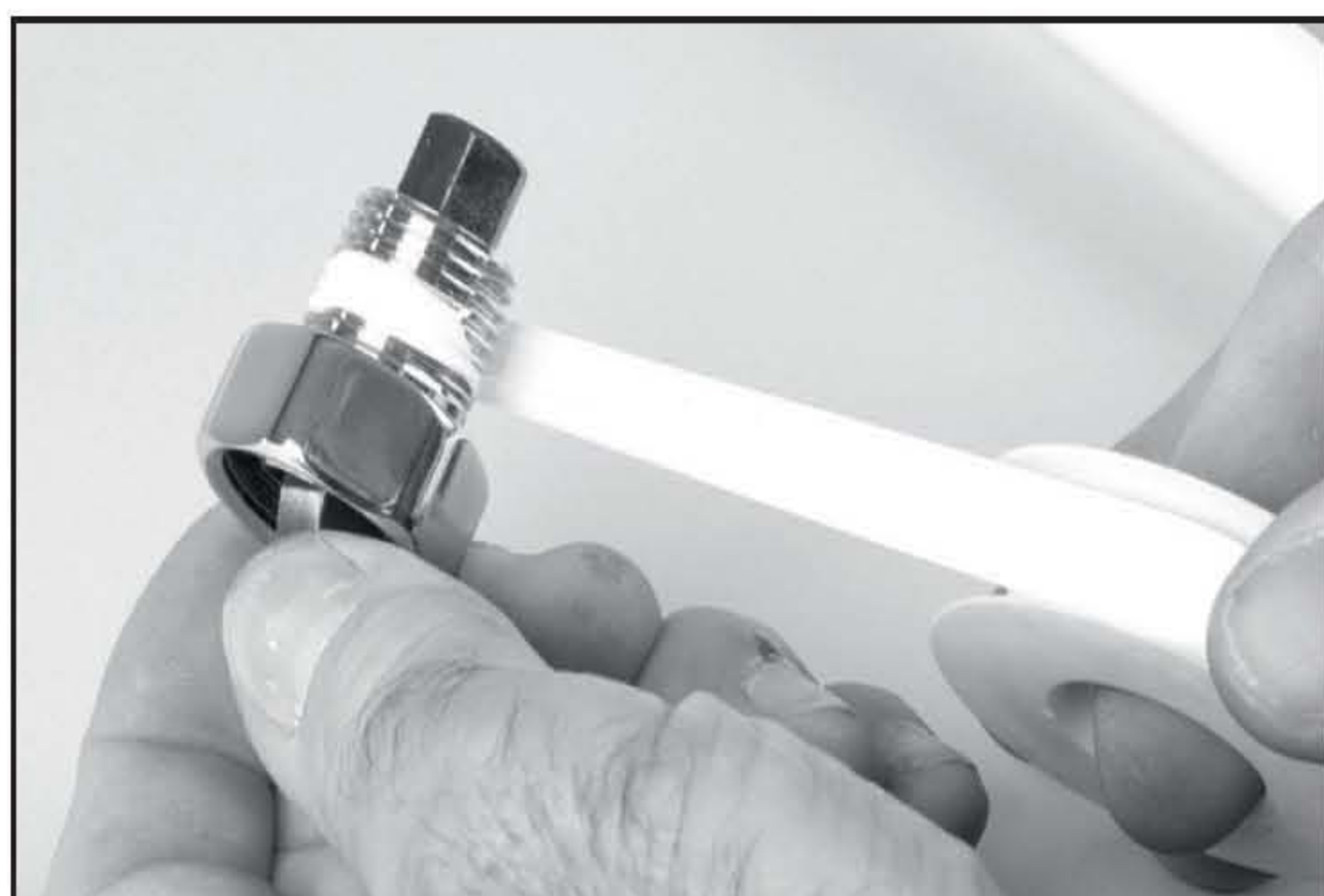
1. Wrap PTFE tape clockwise around the tail thread