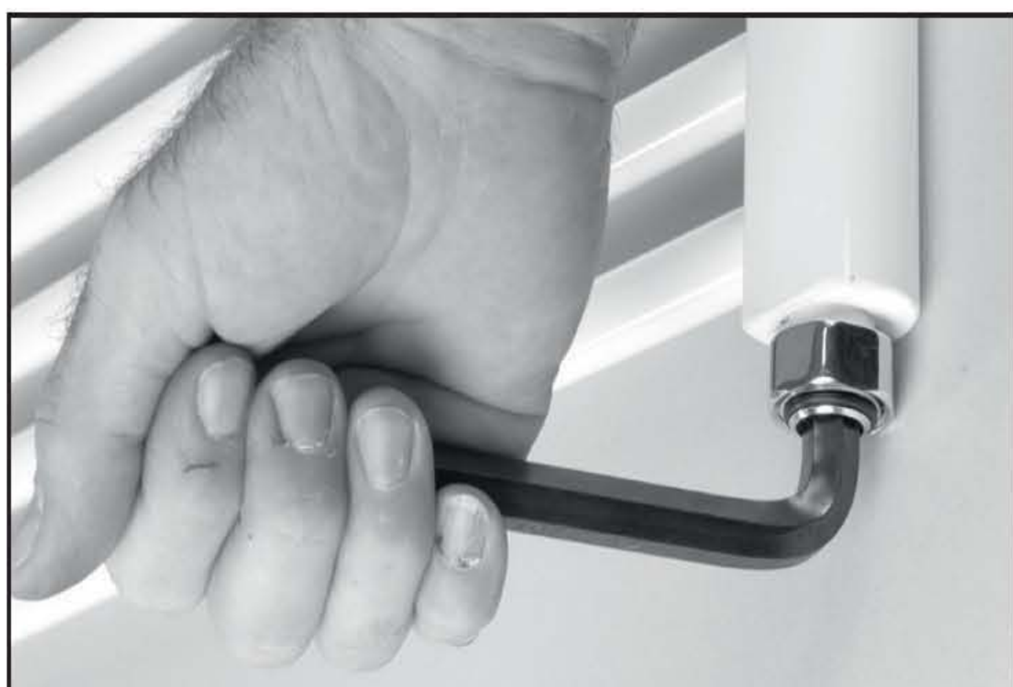
3. Tighten using an appropriate tool