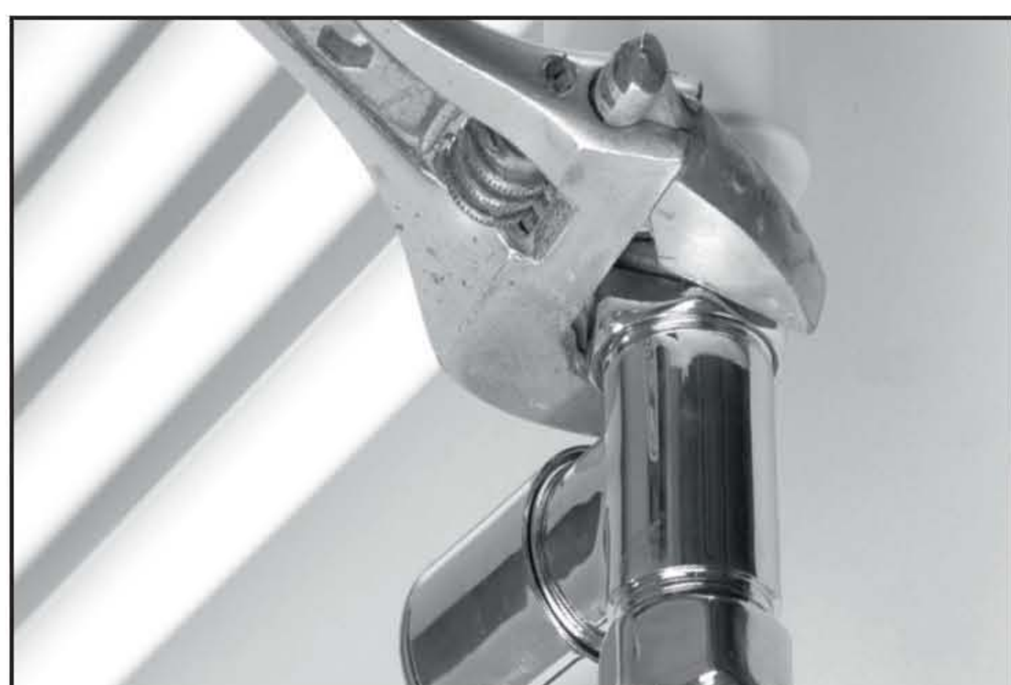
5. Fully tighten the valve using an appropriate tool