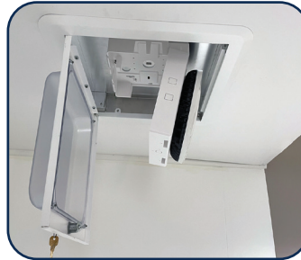
Model 1075-MTDOME with an Aruba AP-635 Access Point installed