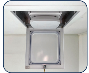
Model 1075-MPDOME with a Cisco C9136AXI Access Point Installed