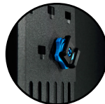
Cable Bundle Swivel, installed

Note: X=Color: 7=Black, E=Glacier White. Shipping weight is for 7"W (178 mm) Lashing Panels.