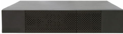
Rear Panel View

Increase the on-battery runtime for UPS systems by adding additional external battery packs to the UPS. Each battery pack matches specific UPS models. Battery Packs use 2U or 3U of rack-mount space and should be placed adjacent to the supported UPS.