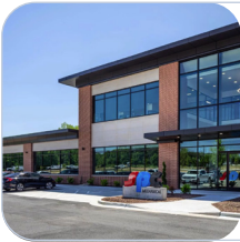
SPC Mechanical Headquarters Wendell, NC