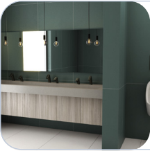
Luxury Hotel Natural finishes, bright tones, and verdant decor define this room idea for luxury hotels.