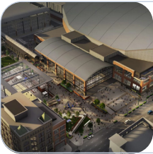
Gainbridge Fieldhouse Indianapolis, IN