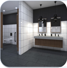
Hubbard Street® Sophisticated design with sustainable efficiency