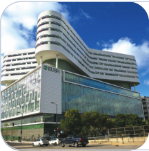
Rush University Medical Center Chicago, IL