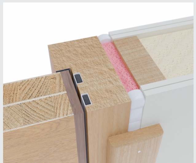
Image B – FAS Fire Door Intumescent Acrylic Sealant with Fire Door Foam™ for joint widths up to 25mm to achieve ratings of up to 120 minutes when applied correctly.