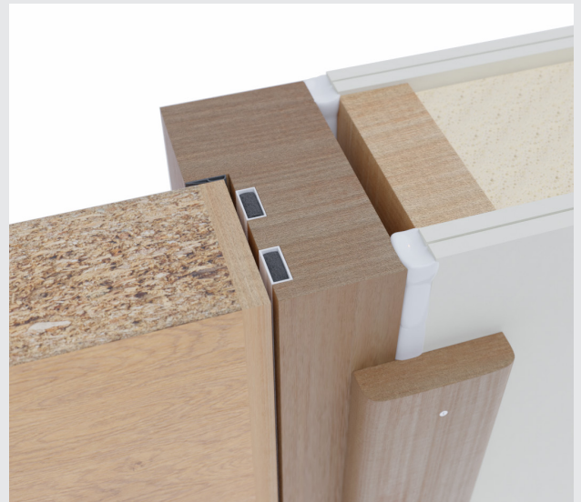
Image A – FAS Fire Door Intumescent sealant for joint widths up to 5mm require no backing.