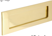
Victorian Letter Plate Polished Brass