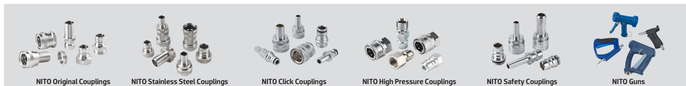
NITO Original Couplings